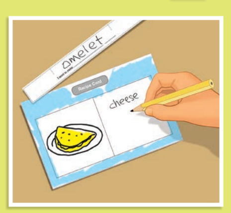
2. Draw a picture. Write what you need.