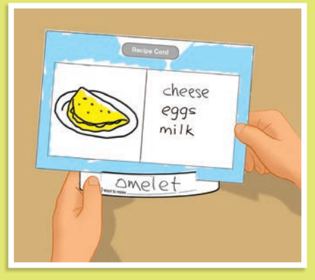
3. Put the recipe card on the circle.