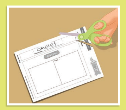
I. Write the food you want to make. Cut the pieces.