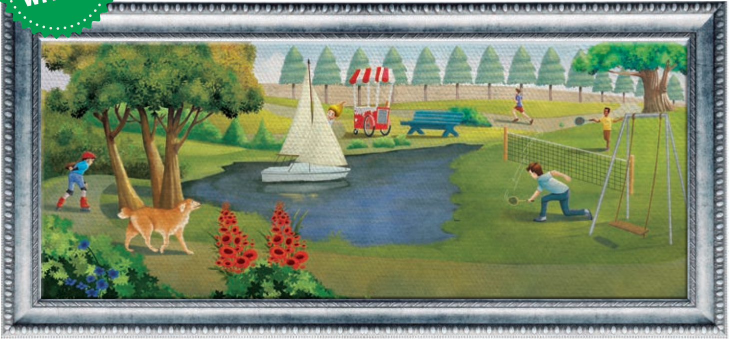
Tom Webster A day at the lake. Oil paint on canvas.