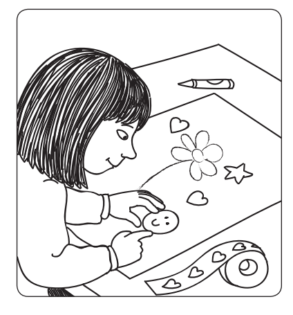
2. Put decorations on your picture.