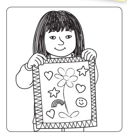
3. Draw a frame for your picture.