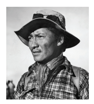
5 Tenzing Norgay