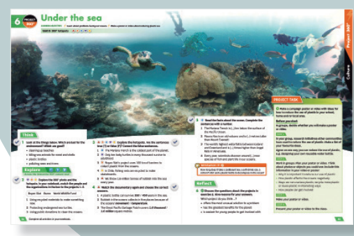
Learning about the contamination of our oceans