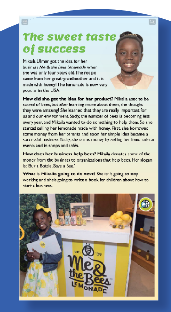
Googleable reading texts