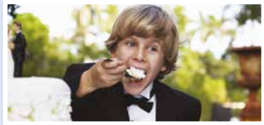
3 The cake / delicious