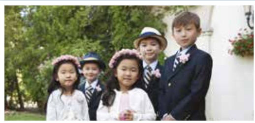
2 The children / tired