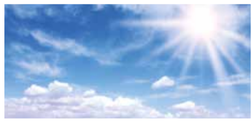
1 The weather / sunny