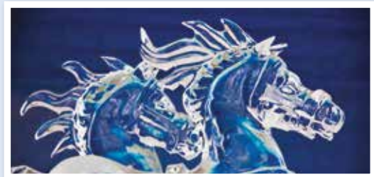
4 The ice statue / a swan